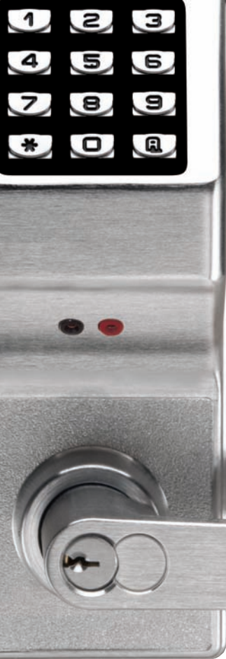
DL5300IC PIN Lock Front/Back View, shown