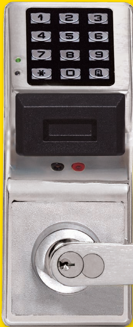
PDL5300IC Prox/PIN Lock front/back view, shown

Double-sided Trilogys for PIN code or prox access from 2 sides of the door